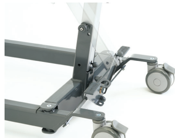
Tool-less and easy to fold.