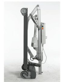
Store upright to save space.