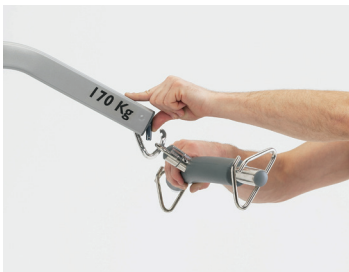
Quick release attachments.