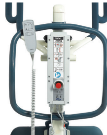
Intelligent monitoring system.