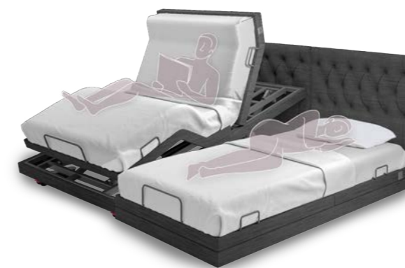
▲ Companion Sleeping See Configurations section for more companion options.

*Carers should seek advice from a trained Allied Health professional for correct manual handling techniques.