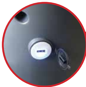
Handy USB fitting