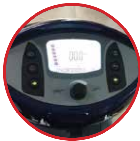
New Anti Glare LCD Screen