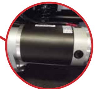
Powerful 4 Pole Motor