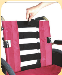
Tension Adj. Backrest