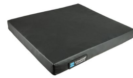
Comfort Elements® with Gel