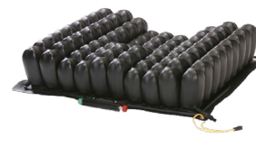
ROHO® CONTOUR SELECT®