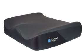
Comfort Saddle 7 Series