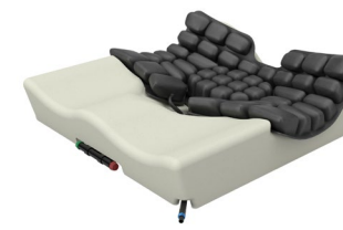
ROHO® Hybrid Select