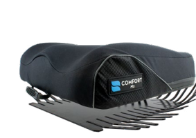
Comfort M2 with ATI