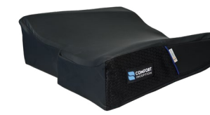
Comfort Custom Inception