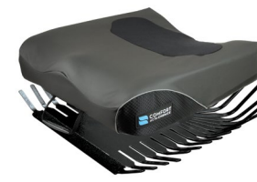
Comfort Embrace with ATI