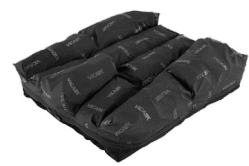
Vicair Vicair® Vector O2