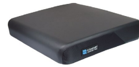
Comfort Support Pro 7 Series