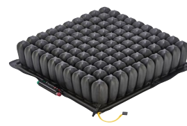
ROHO® QUADTRO SELECT®