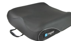
Comfort M2 Zero-Elevation M2 Anti-Thrust