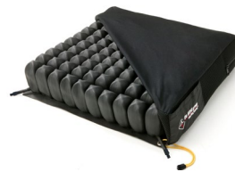
ROHO® Dual Compartment