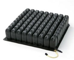
ROHO® Single Compartment