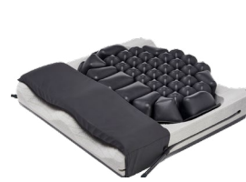
ROHO® HYBRID ELITE® Dual Compartment