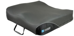
Comfort Embrace™ Zero-Elevation Embrace™ Anti-Thrust