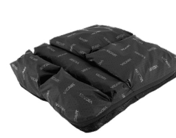
Vicair Vicair® Adjuster O2