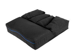
Vicair Vicair® Active O2