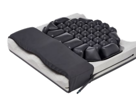
ROHO® Hybrid Elite SR® Single Compartment